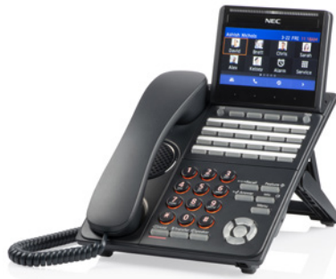
DT930 24 button