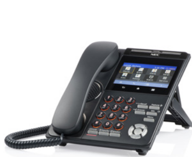
DT930 Touch Panel