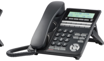
DT920 12 button