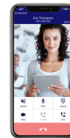
ST500 Mobile Client

*Handsets may have regional availability - check with your NEC reseller for further details