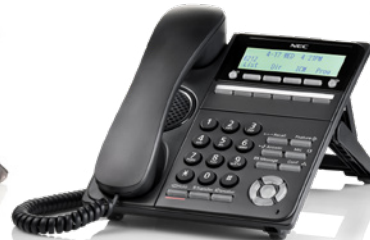
DT510 6 button