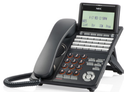
DT530 24 button